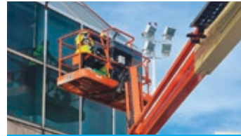
BUILDING FACADE & GLASS CLEANING