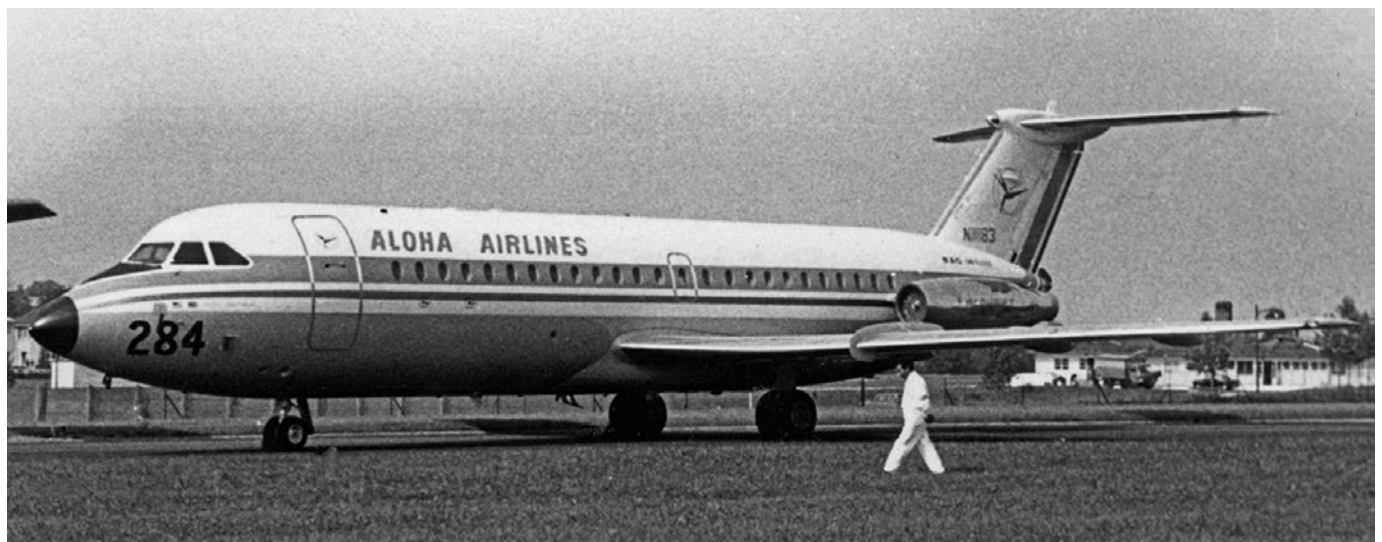
British Aircraft Corporation BAC 1-11-215