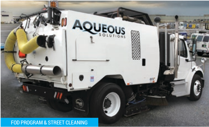
FOD PROGRAM & STREET CLEANING