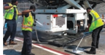
PRESSURE WASHING & RECLAMATION