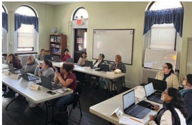
School Sisters of Notre Dame

Today, through the School Sisters of Notre Dame Educational Center's tuition-free programs—including High School Equivalency (GED), six levels of ESOL, Digital Literacy, and Citizenship