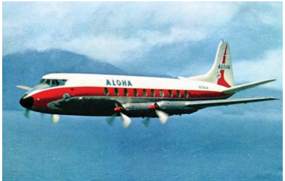
Vickers V.745 Viscount

Although both aircraft were powered by turboprop engines, whose turbine core turned propellers, it began service with a type powered by pure-jet engines three years later, when it took delivery of the first of two Rolls-Royce Spey-powered British