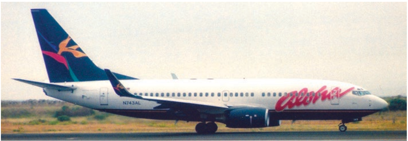
Boeing 737-700 in Bird of Paradise Colors