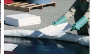
EMERGENCY SPILL RESPONSE