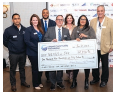
The proceeds from the ACF Airport Executive Speaker Series luncheon were donated directly to the CUNY Aviation Center at York College, Vaughn College of Aeronautics & Technology, and Women Inspiring Nex-Gen Stars (WINGS) at JFK.