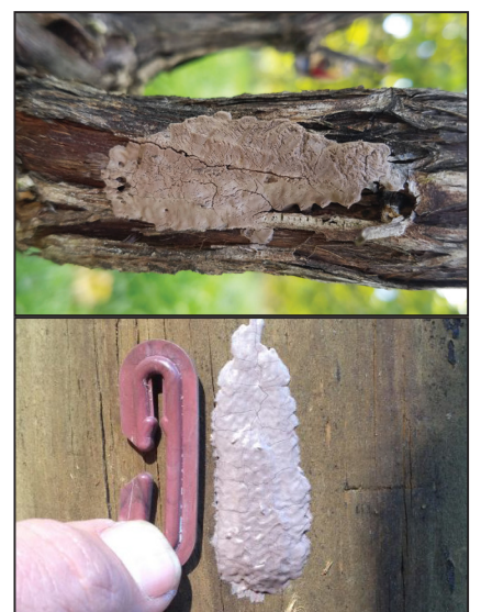
Egg masses are approximately 1 to 2 inches long. Old egg masses (top) look like dry, cracked mud. Fresh egg masses (bottom) are white and glossy.