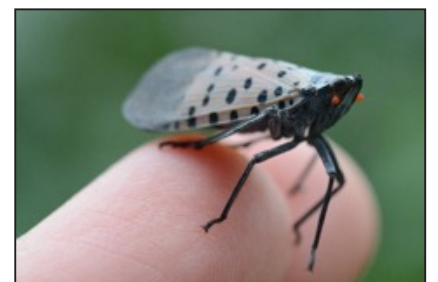
Adult SLF are approximately 1 inch long.

Squash and kill all adult SLF. Crush egg masses and scrape them off surfaces or spray them with a high-pressure hose. Have you seen this pest? Report your findings to your State plant regulatory official: www.nationalplantboard.org/members .